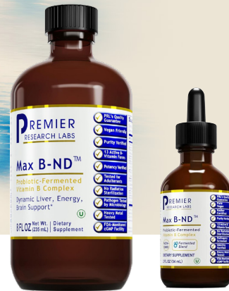
Available in 2 sizes

Max B-ND™ provides 13 forms of essential, absorbable B vitamins. This tireless group of vitamins, known as B-complex, helps convert the food you eat into energy, aids in the production of mood-stimulating neurotransmitters, plays a role in the formation of red blood cells, promotes liver health, and neutralizes cell-damaging free radicals. Additionally, vitamin B supports the function of the adrenal glands, which regulate your body's stress responses.